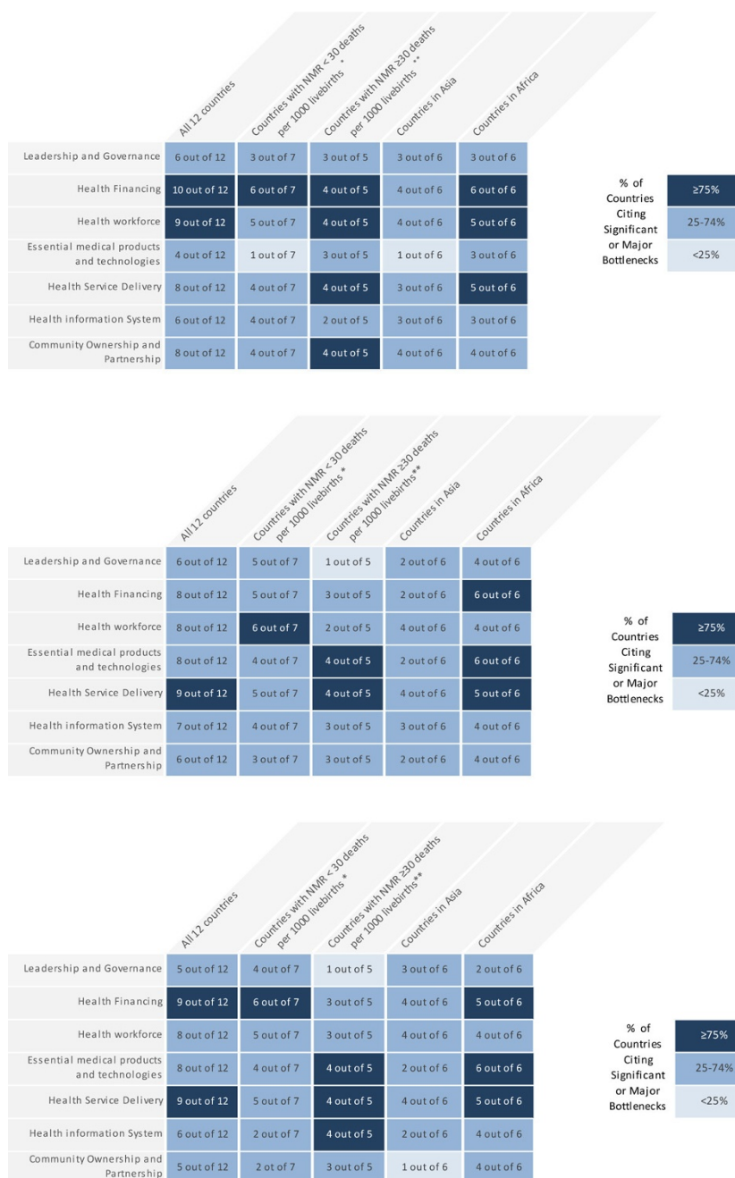
Figure 2 Very major or significant health system bottlenecks for labour and birth. NMR: Neonatal Mortality Rate *Cameroon, Kenya, Malawi, Uganda, Bangladesh, Nepal, Vietnam. **Democratic Republic of Congo, Nigeria, Afghanistan, India, Pakistan. See additional file 2 for more details. Part A: Grading according to very major or significant health system bottlenecks for skilled birth attendance as reported by twelve countries combined. Part B: Grading according to very major or significant health system bottlenecks for basic emergency obstetric care (BEmOC) as reported by twelve countries combined. Part C: Grading according to very major or significant health system bottlenecks for comprehensive emergency obstetric care (CEmOC) as reported by twelve countries combined.

standards for essential care at all levels, including in the private sector. Teams suggested improved context-specific planning at all levels in order to reduce unmet need and address inequities by focusing on marginalised and hard-to-reach population groups. The need for rational