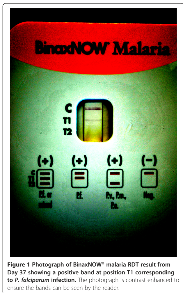
Figure 1 Photograph of BinaxNOW® malaria RDT result from Day 37 showing a positive band at position T1 corresponding to P. falciparum infection. The photograph is contrast enhanced to ensure the bands can be seen by the reader.

after completing therapy, he developed recurrence of fevers and his blood cultures were again positive for S. Typhi on day 37 without evidence for gallbladder disease based on abdominal ultrasound. He was then successfully treated for a relapse of typhoid fever with two weeks intravenous Ceftriaxone through a home parenteral therapy program with a peripherally inserted central catheter.