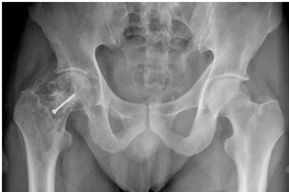
Figure 1 AP Pelvis radiograph showing a multicystic lesion in the right proximal femur with a cortical screw in situ.

is essential in determining the extent of bony disease, especially in the proximal femur. If hip replacement is necessary, the feasibility of using routine implants depends on the destruction of proximal femoral structures, best shown by a CT. If the calcar and/or the greater trochanter have to be sacrificed, the surgical plan (implant use, rehabilitation, potential outcome) changes. There were no other cysts visible.