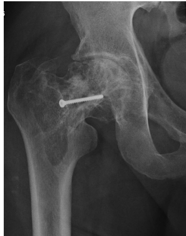
Figure 3 AP radiograph of the right hip showing a basicervical femoral fracture.

lateralis and rectus femoris muscles. It had eroded the anterior cortex of the proximal metaphysis, just above the lesser trochanter. After thorough debridement, an adjuvant was used, which is well-established in tumor surgery. The bony bed was exposed to a concentrated phenol solution (70%) via a soaked gauze, followed by copious lavage with a concentrated alcohol solution. No spillage or anaphylaxis was observed during the first part of the procedure.