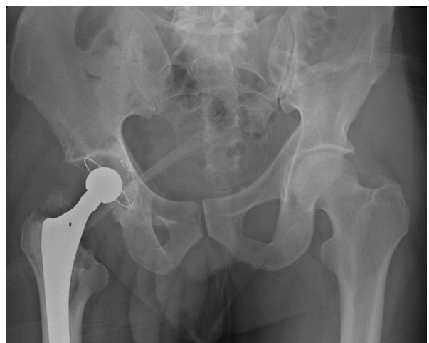
Figure 6 1 year postoperatively, the AP pelvic radiograph shows a well placed THR with no loosening.

Locally aggressive, benign bone tumors require specific techniques to avoid recurrence, thus the experience from their treatment can be used as an analogy for the treatment of musculoskeletal hydatidosis. Surgeons usually perform intralesional curettage, together with some form of adjuvant therapy (the use of intralesional curettage alone can be followed by a recurrence rate of up to 50%). The most commonly applied adjuvant therapies/procedures are cauterization, high-speed burring, exothermic cement polymerization and the use of