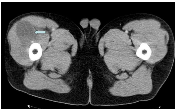
Figure 2 A coronal slice of the CT scan performed showing a large soft tissue mass on the anterolateral part of the right thigh.

A two step procedure was performed under the same anesthetic, utilizing an extended lateral (Hardinge) approach, with distal extension. During the first part of the procedure an en-bloc excision of the cyst was performed. The lesion was localized between the vastus