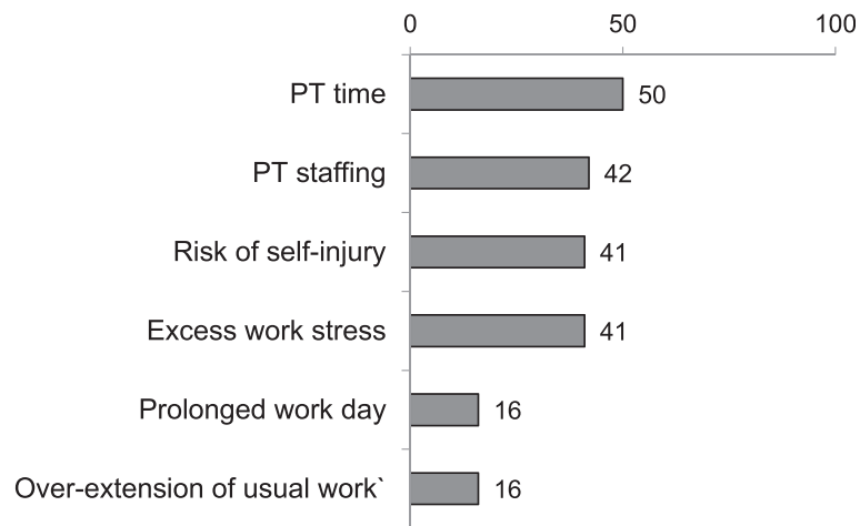
Figure 3 Physical therapist (PT) reported barriers to early mobilization of critically ill patients (n = 12, % reporting agree).

experience with EM were not associated with greater report of potential benefits across groups of MICU clinicians. Clinicians across all fields (physicians, nurses and PTs) reported acceptance of EM as a therapy in patients requiring MV, while most reported disagreement with use of EM in patients on vasoactive agents. Studies of patients receiving EM demonstrate that mobility is safe and feasible in patients on stable dose of vasoactive agents with very few adverse events [7,11,15,24]. Further targeted education around appropriate patient selection and the role of mobility in patients with stable shock may enhance clinician acceptance of mobility in this subgroup of patients.