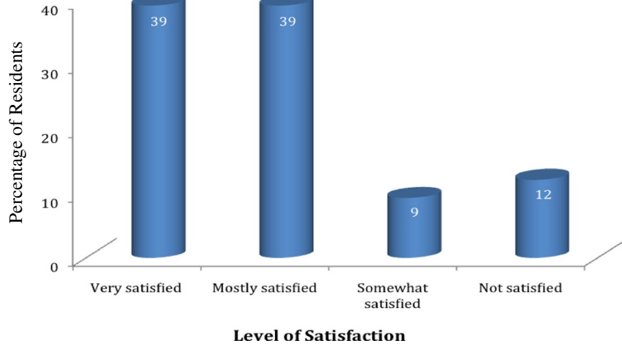
Figure 3 Level of resident satisfaction on peripheral nerve block education.

[7]. For both sciatic and axillary blocks, over half (52%) of respondents reported they were either “not comfortable” or only “somewhat comfortable” performing the blocks. Since the ACGME does not provide guidelines as to the specific types of blocks, it is possible that a resident may meet the requirement with a moderate to large number of one or two types of blocks, while being largely unfamiliar with many other types. Rosenblatt et al. [3] reported that the learning curve for interscalene blocks was steep. Only 50% of residents that had performed seven to nine previous blocks were able to perform the block autonomously, whereas 87.5% of residents who had performed fifteen prior blocks had autonomous success. Similarly, Konrad et al. [8] reported a 70% success rate after performance of 20 brachial plexus blocks. As Kopacz [9] concluded, our results suggest that 40 PNBs may be inadequate for the majority of residents to feel comfortable with a subset of PNBs commonly used in practice.