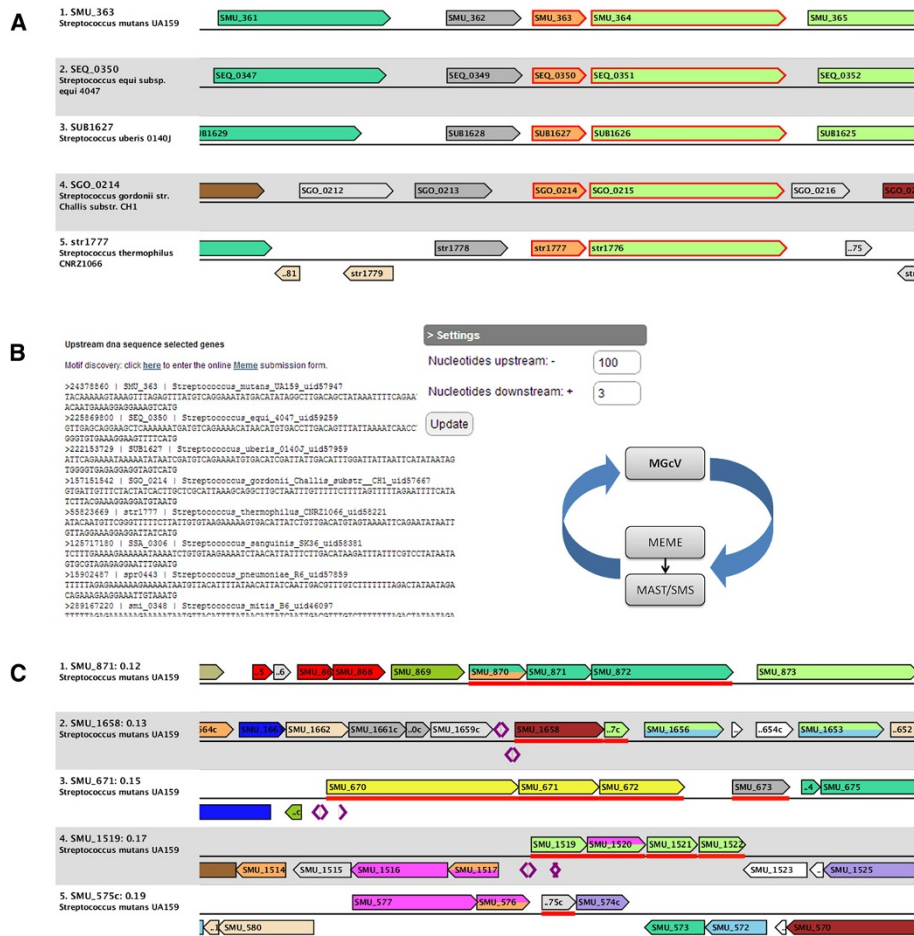
Figure 3 Application of MGcV in the reconstruction of GlnR-mediated regulation in Streptococcus mutans . A Comparative context map of GlnR homologs obtained via a BLAST search in all sequenced Streptococci (only five species are shown). The GlnRA operon and its direct genomic context is clearly conserved in the Streptococci. The map was used to graphically select those genes that could be preceded by a binding site. B The “upstream region” option of the “Data-export”-box was used to obtain upstream regions of the selected genes. Subsequently, the available link to MEME was used to search for possible overrepresented motifs. The results were refined and a motif defined [63], which was then used to search and score putative binding sites (e.g. using MAST or SMS). C A comparative context map ranked on expression ratios (low-to-high) of a GlnR mutant, visualized in conjunction with predicted GlnR binding sites. To exemplify, the figure is limited to the top 5 of down-regulated genes. In this map, gene expression ratios are represented in a colored bar (red-to-green gradient; red is down-regulated) at the baseline and putative binding sites are designated by purple arrows (direction representing the strand). Both the microarray data and putative binding sites and their corresponding binding sites were uploaded using the “Data import”-box. The resulting map allows the analysis of the putative GlnR binding sites in light of the expression data of the GlnR mutant. Most of the top down regulated genes (SMU_1658, SMU_671 and SMU_1519 in Figure 3C) indeed are preceded by a putative binding site.

threshold for both the predictions as well as the expression data.