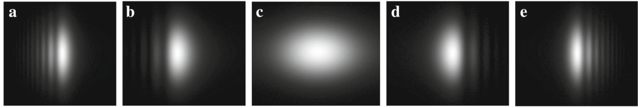
Fig. 1 Calculated far-field intensity distributions. The screen is between the lens and the focal plane ( a, b ); at focal plane ( c ); after the focal plane ( d, f )

focused Gaussian beam diffraction by a straight edge placed in the beam waist region.