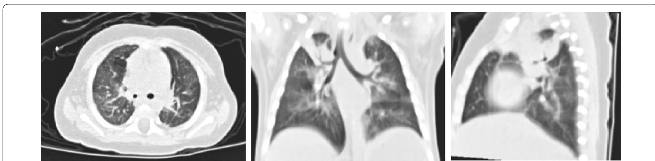
Fig. 3 High-resolution CT scan of the chest revealing diffuse infiltration and areas of consolidation in the right upper in a 4-month-old girl

PH was present in only 12 patients in our study, but it was a strong predictor of death, as well as an independent risk factor for death. A previous study reported refractory PH in fatal pertussis, which is often associated with hyperleukocytosis [21]. In our study, the leucocytosis in one of patient who died exceeded 100 \times 10^9/\text{L} ( 103.23 \times 10^9/\text{L} ). We identified that leucocytosis > 70.0 \times 10^9/\text{L} and absolute lymphocyte count > 20 \times 10^9/\text{L} were also significantly associated with the deaths of patients with severe pertussis, and leucocytosis ( > 70.0 \times 10^9/\text{L} ) was an independent risk factor for death. The mechanism of PH and hyperleukocytosis occurred in severe pertussis due to pertussis toxin (PT) [18]. PT can affect cellular signalling and promote leucocytosis with lymphocytosis, which can result in a hyper-viscosity syndrome [22]. Previous reports have shown