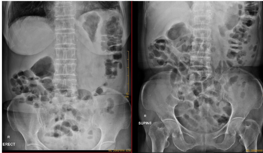
Fig. 1 Abdominal X-ray in supine and erect position. Prominent bowel loops were noted in the Abdominal X-ray, together with multiple fluid levels in erect Abdominal X-ray suggestive of underlying ileus. Psoas shadow was obscured suggestive of possible retroperitoneal pathology, such as infected abdominal aortic aneurysm

weeks for patients with uncomplicated disease, and 3–4 months for osteoarticular involvement, abscess and epididymo-orchitis; with the exception of case 4 who ceased treatment after 2 days of antibiotics. The patient with intravascular infection such as abdominal aortitis was put on long term oral suppressive therapy after endovascular surgery. There were 3 (23.1%) patients with uncomplicated disease receiving doxycycline plus gentamicin, whereas 1 (7.7%) received doxycycline plus rifampin; 5 (38.5%) patients received a combination of doxycycline, gentamicin plus rifampin, and 3 (23.1%) patients with more complicated disease received a combination of ceftriaxone and doxycycline, gentamicin plus rifampin.