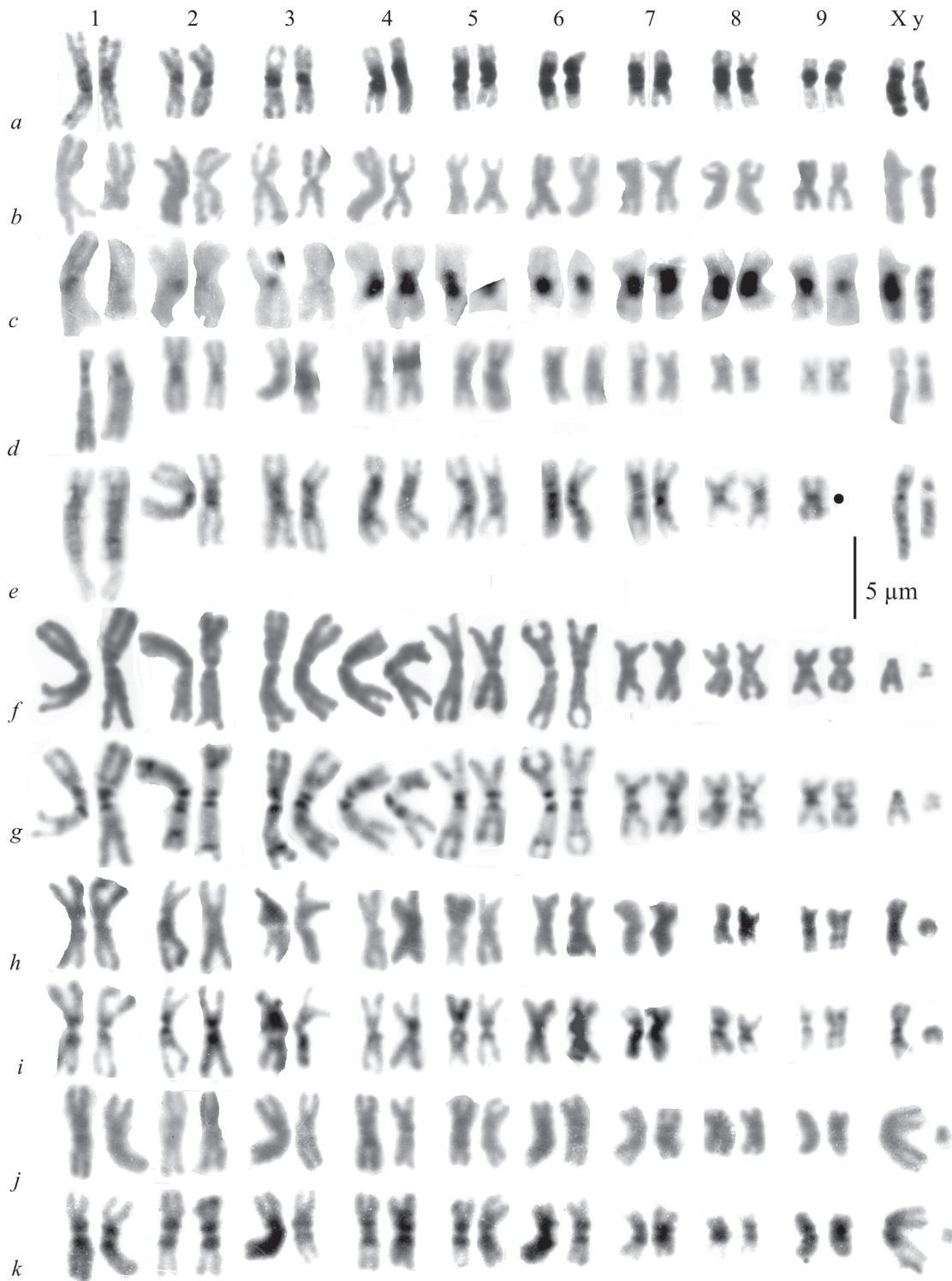
Fig. 1. Karyotypes of Melinopterus sphacelatus -group species, from mitotic mid-gut chromosomes of adult beetles: (a–c) M. sphacelatus [(a) male, C-banded, Netherlands; (b, c) female, Madrid [(b) Giemsa stained, (c) the same nucleus C-banded]]; (d, e) M. punctatosulcatus , male, Sandwich [(d) Giemsa stained, (e) nucleus from the same specimen, C-banded]; (f, g) M. maroccanus , male, Moyen Atlas [(f) Giemsa stained, (g) the same nucleus, C-banded]; (h–k) M. villarreali , males [(h, i) Venta de Facinas, the same nucleus Giemsa stained and C-banded, (j, k), Rif, the same nucleus Giemsa stained and C-banded]. Scale bar 5 \mu m.