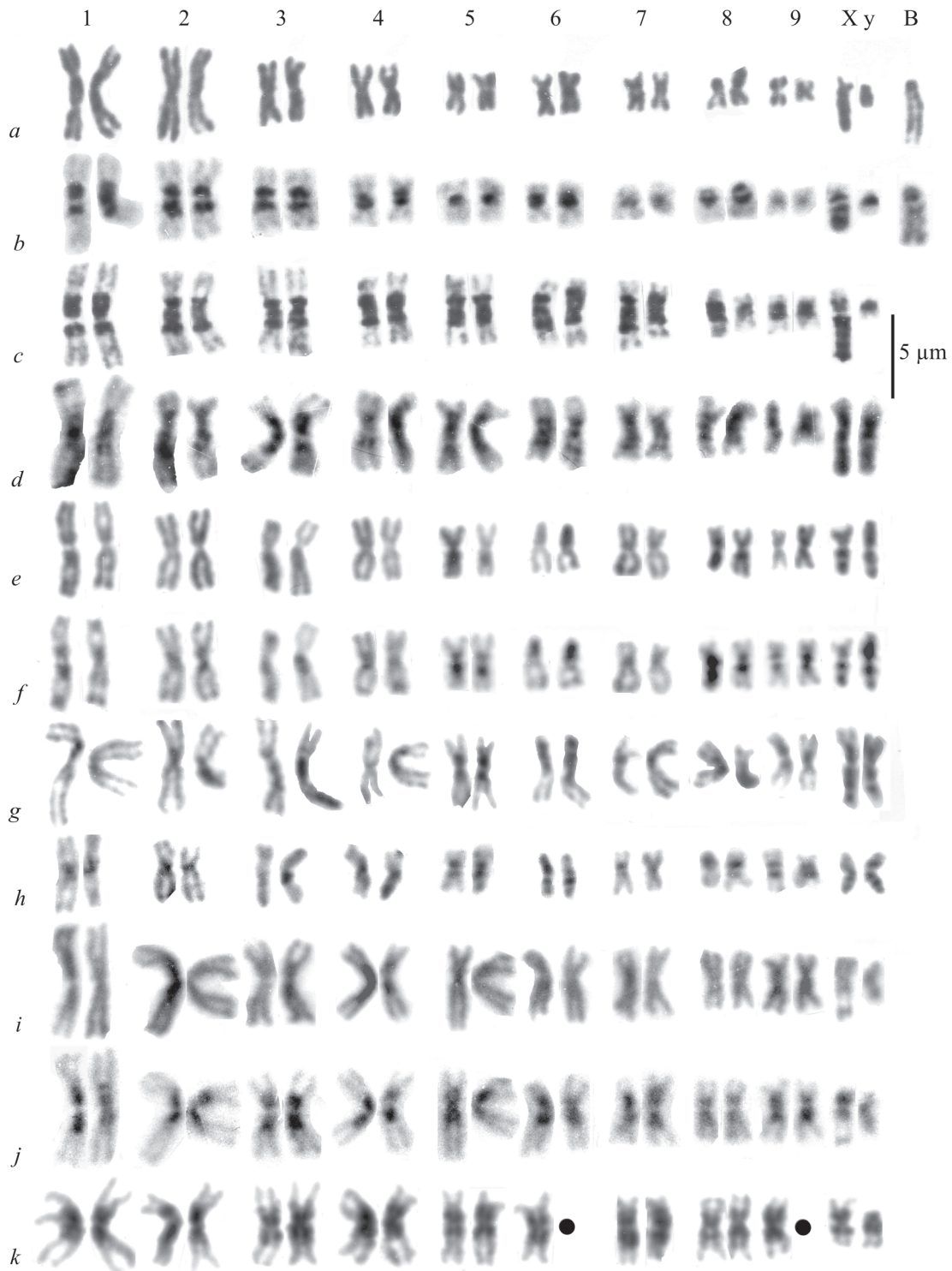
Fig. 2. Karyotypes of Melinopterus species, not sphacelatus -group, from mitotic mid-gut chromosomes of adult beetles: (a, b) M. prodromus male with one B-chromosome, from Bookham Common [(a) Giemsa stained, (b) the same nucleus C-banded]; (c, d) M. consputus , C-banded [(c) male from Lydden, (d) female from Sardinia]; (e–h) M. abeillei La Saucedá [(e, f) male: (e) Giemsa stained, (f) the same nucleus C-banded], (g, h) females [(g) Giemsa stained, (h) C-banded]; (i–k) M. tingens , males, San Roque [(i) Giemsa stained, (j) the same nucleus C-banded, (k) another nucleus, C-banded with the bands very clear, but lacking two chromosomes indicated by large dots]. Scale bar 5 μm.