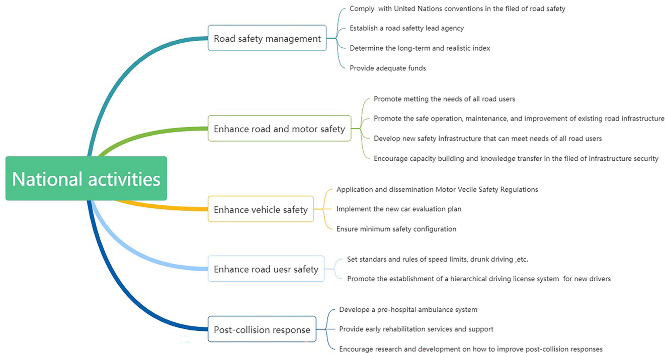
Fig. 1 Five pillars of national activites encouraged in the Decade of Road Safety.

Search strategy. In November 2021, the literature was searched in the following electronic databases: China National Knowledge Infrastructure (CNKI), Wanfang database, Weipu (VIP) database and PubMed/MEDLINE. Then, Chinese and English language documents published in the research field of RTIs in China were collected. First, the keywords in Chinese (“road traffic injury” OR “traffic accidents”) AND (“epidemiology” OR “characteristics”) or (“traffic injury OR traffic safety”) AND “COVID-19”) were used to search the CNKI, which yielded 87 documents and 2 documents in Chinese and English, respectively. When using the same search keywords as those used in the CNKI, 147 articles and 281 articles were obtained from the Wanfang database and VIP database, respectively. In the MEDLINE database, 414 articles were obtained by using the keywords (“road traffic injury” OR “road traffic accident” OR “car accident”) AND (“epidemiological characteristics” OR “risk factors” OR “variation tendency” OR