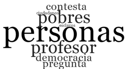
Fig. 2 General cloud mark with the account of the development of critical citizenship in the educational contexts observed. This visualization called a cloud mark is the result of the word frequency query that Nvivo allows in this case of the “Critical citizenship” node: it illustrates the terms or the words that are most often repeated in the references categorized under this node of all the records obtained and indicates—proportionally by size—their greater or lesser presence and relevance in the observations of both sets of teaching materials. The translation of the words from Spanish to English in descending order from highest to lowest is: people, poor, teacher, democracy, question, answer, citizens, slaves.