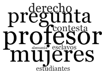
Fig. 1 General cloud mark with an account of the development of active citizenship in the educational contexts observed. This visualization called a cloud mark is the result of the word frequency query that Nvivo allows in this case of the “Active citizenship” node: it illustrates the terms or the words that are most often repeated in the references categorized under this node of all the records obtained and indicates—proportionally by size—their greater or lesser presence and relevance in the observations of both sets of teaching materials. The translation of the words from Spanish to English in descending order from highest to lowest is: teacher, women, question, law, answer, slaves, students, Germany.

In the classroom citizenship is exercised by motivating and simulating the role of students as citizens, creating learning contexts focusing on the question of historical content, and relating them to human rights, the treatment of relevant social problems and identification with other events, or more familiar or better known forms of discrimination (for example, totalitarianism, such as Nazism). The cloud mark 4 in Fig. 1 allows for more detailed analysis of the most frequent words and their meaning in the context of observations when they refer to the development of active citizenship. Students express their views in the classroom in terms of questions that the teacher encourages them to answer on topics related to the contents dealt with in the classroom, from the historical dimension (slaves, women in Athens) and their identification with other social, cultural and civic groups (in this case, Nazism in Germany).