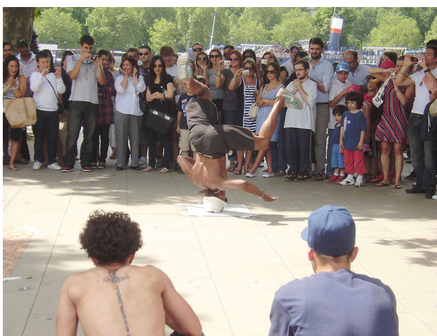
Fig. 5 Southbank, London—the sequence of spaces along the south bank of the Thames in central London have been transformed in recent years and now host a variety of ‘fun’ activities from public art, to performance, to consumption

This diversity recognises the diversity of lifestyles, preferences and needs amongst urban populations and that through the design of their public realm there is the opportunity for urban areas to offer something for everyone