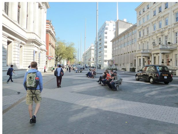
Fig. 4 Exhibition Road, London—here the local authority, the Royal Borough of Kensington and Chelsea, adopted shared space ideas to re-balance the priority given to pedestrians, overlaying the well established street function with a distinct new linear public space function