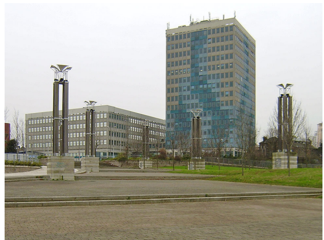
Fig. 13 Royal Arsenal Gardens, London—this new square on the edge of Woolwich in south east London was created at great expense to connect the town to the River Thames, but remained a largely deserted and often foreboding space when the proposed developments around it failed to materialise leaving the space without a purpose

Despite criticisms that public spaces have become over-commercialised and unduly dominated by the pressure to consume (e.g. Hajer and Reijndorp 2001), much of the buzz associated with particularly active spaces will tend to be wrapped up in the activities of consumption of one sort or another—shops, cafes, bars, markets, etc.—and typically these processes animate and enrich public spaces and are welcomed by users (Fig. 14). If the intention is to create such a space then active uses should be carefully designed into the public space from the start, helping to fill them