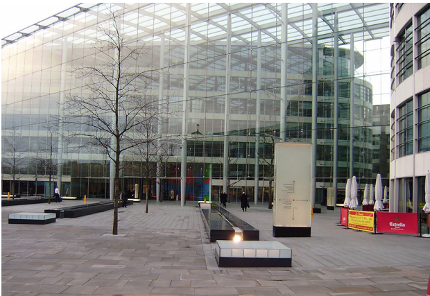
Fig. 11 Tower Place, London—here a new public space extends from between the two new buildings of the development and out into an open area alongside All Hallows-by-the-Tower Church. The presence of a glazed roof over part of this space, the obvious corporate nature of the buildings and the heavy presence of security guards undermines the sense of this being a public space and as a result it is not clear whether the general public are allowed into the space or not

and private realms of the city, recognising that public spaces in the wrong places can be more problematic than the absence of public space altogether (Fig. 12). Instead, public spaces (including all varieties of pseudo-public space) should be designed to appear welcoming, inviting and visually and physically accessible, avoiding any doubt in users' minds that they are clearly public, regardless of who owns and manages them. Equally, private spaces for relaxation such as private or communal gardens have an important and quite distinct role that is separate from the