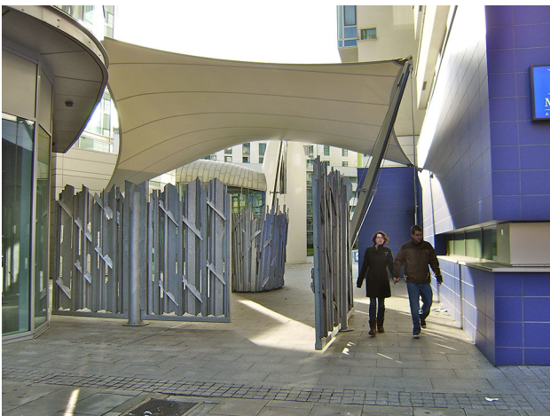
Fig. 12 Empire Square, London—a new public square was required by the planners in the middle of a residential block, but gated on the advice of the Metropolitan Police so that it could be closed at night in order to minimise resident/user conflicts. This has resulted in poor visual permeability and a less than clear status

and private realms of the city, recognising that public spaces in the wrong places can be more problematic than the absence of public space altogether (Fig. 12). Instead, public spaces (including all varieties of pseudo-public space) should be designed to appear welcoming, inviting and visually and physically accessible, avoiding any doubt in users' minds that they are clearly public, regardless of who owns and manages them. Equally, private spaces for relaxation such as private or communal gardens have an important and quite distinct role that is separate from the