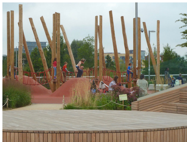
Fig. 6 Queen Elizabeth Olympic Park, London—the new spaces of Queen Elizabeth Olympic Park are varied in themselves but range from raucous play spaces to quiet areas for peaceful relaxation

in the right locations although not necessarily everything for all everywhere. It is important for planners to recognise this legitimate diversity, particularly in large cities, and to avoid imposing one-size-fits-all aspirations on public space projects that play into critiques around the homogenisation of public space (e.g. Light and Smith 1998; Sennett 1990). In this respect, the public spaces of a town or city can be planned in a strategic sense just as the buildings are, with care taken to ensure that all sections of the community are catered for, and that spaces are provided in locations that are safe, convenient and inviting to use and that avoid conflict, for example, between skateboarders and commercial interests or between revellers and residents.