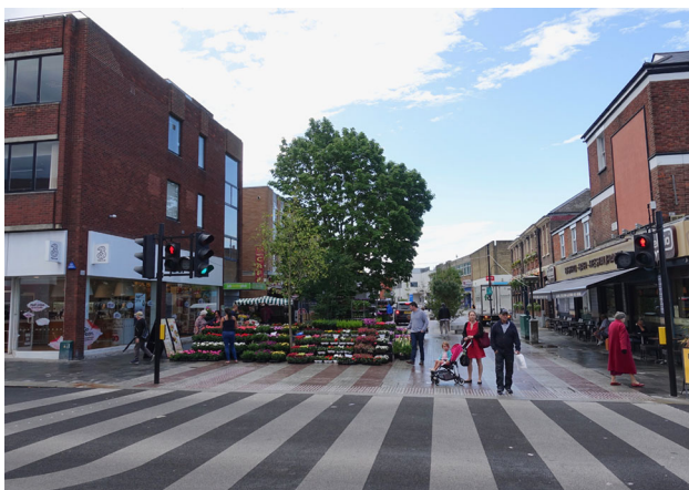
Fig. 2 Passey Place, London—here the end of a side street onto Eltham's busy High Street has been paved over to create an incidental space for shoppers to rest and for informal activities to be hosted

All these sorts of processes will involve distinct planning inputs although they may be initiated outside of the formal planning processes, and most notably from within the highways/street management function of municipalities (Fig. 4). In all cases, planners will need to be flexible enough to understand and embrace the evolving nature of public space, and mindful of the important role of the range of public sector agencies that impact on the shaping of public spaces. In London, for example, four forms of regulation have been critical when creating or re-shaping public spaces: