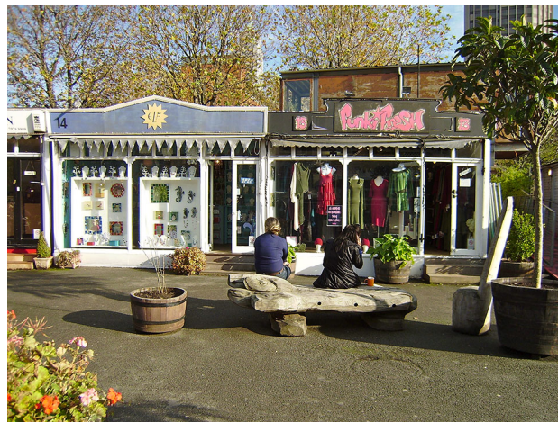
Fig. 3 Gabriel's Wharf, London—was created as a temporary space in 1988, and almost 30 years later is still a favoured meeting and activity place despite its somewhat (and increasingly) shabby appearance