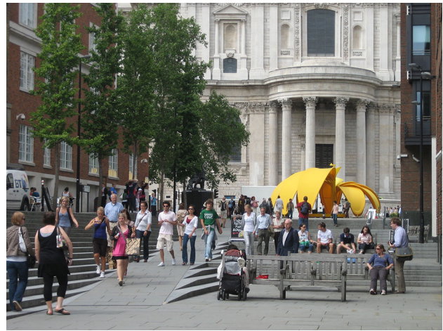
Fig. 17 Peter’s Hill, London—here the dominant movement corridor through the space is very strong from St Pauls Cathedral to the River Thames, but space is provided in quieter areas for those who wish to stop and relax

The challenge of traffic dominance is a perennial problem that continues to blight many public spaces with severe knock-on impacts on their social life (Gehl and Gemzoe