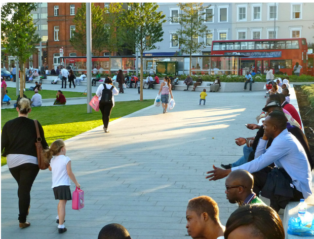
Fig. 22 General Gordon Square, London—the complete redesign of this space has transformed it from a sad and largely abandoned space into an active hub of life for the ethnically and economically diverse communities that live in Woolwich. In the summer it fills with people who sit, lounge and play on and around the grass and (sometimes) watch the big screen

uncluttered and with resilient natural materials, trees and planting), and background level of activity, are able to adapt and change over time in a manner that can withstand