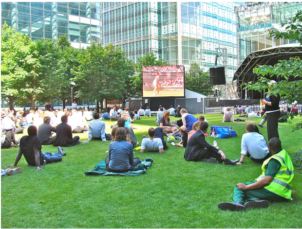
Fig. 16 Canada Square, London—is heavily used throughout the year for large-scale events and for everyday relaxation and social engagement. A big screen is a popular lunch time and after work entertainment for the workers of Canary Wharf

observational work revealed that movement in public space predominantly flows along dominant movement corridors or ‘desire lines’ passing right through spaces, and from movement corridors to the active uses on a space and vice versa. In the majority of spaces that are well integrated into the movement network, only a small proportion of users will actually stop within and engage directly with the space itself whilst the majority will pass straight through. Nevertheless, high levels of through movement will generally stimulate high levels of activity on the space, with the highest density of such activities (and social encounters) typically occurring in the gaps between the dominant lines of movement and being drawn to and around key amenities and features (Fig. 17).