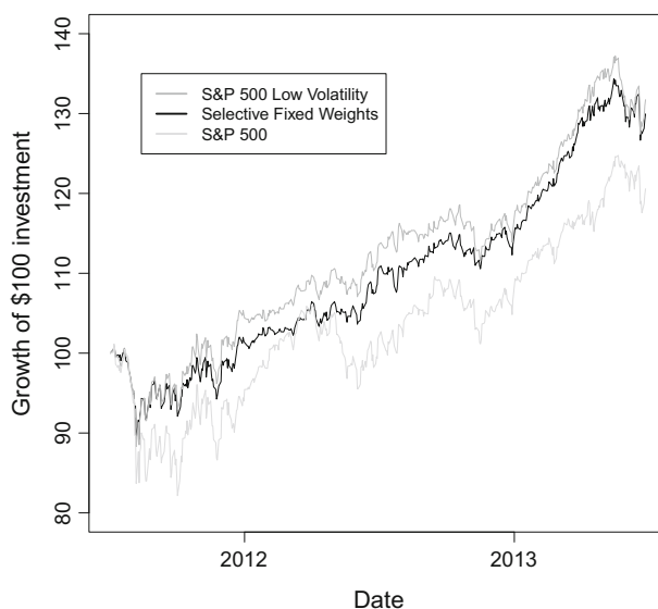
Figure 2: Performance of various portfolios for test period.