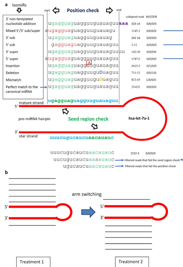
Figure 1. The core algorithms of mirPRO for exploration and quantification of miRNA variants.

(A) IsomiR identification. Human precursor miRNA “hsa-let-7a-1” is used for illustration, and the collapsed reads are not real data. mirPRO allows base errors (mismatch and indel) and soft clips in read mapping, and permits position check and optional seed region check in mature miRNA quantification. The isomiRs annotated by mirPRO include mature miRNA reads with mismatches, insertions, deletions, or a mixture, with 3'-end non-templated nucleotide addition, and with nucleotide shift (super or sub) at their 5', 3' or both ends. Mature miRNA variants: “5 (3) super (sub)” means the reads have 5 (3) end upstream (downstream) nucleotide shift in collapsed-read-to-hairpin mappings. The upper case “D” in the aligned sequence means deletion. The column “collapsed read” has the identifier (“XXX-YYY”) for collapsed reads, where “XXX” is a unique number and “YYY” is the read count. The column “M/I/D/N” represents the number of “mismatches/insertions/deletions/nucleotide N” in the alignment. For the two hairpin arms, most of the collapsed reads are mapped to the 5' arm while few reads are mapped to the 3' arm. (B) Arm switching detection. More reads are mapped to the 5' arm of the precursor in treatment 1, while more reads are mapped to the 3' arm in treatment 2. This indicates that two different mature miRNAs are generated from two different arms of the same precursor in two different treatments (e.g., different tissues).