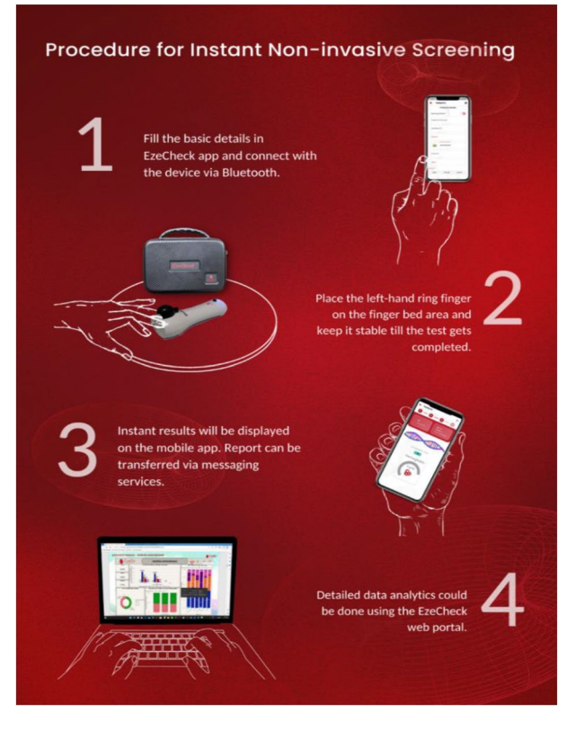
Figure 2. Representation of the process involved for conducting the Non-invasive Haemoglobin test using the EzeCheck device.