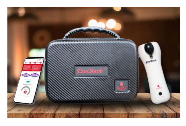
Figure 1. EzeCheck product image.