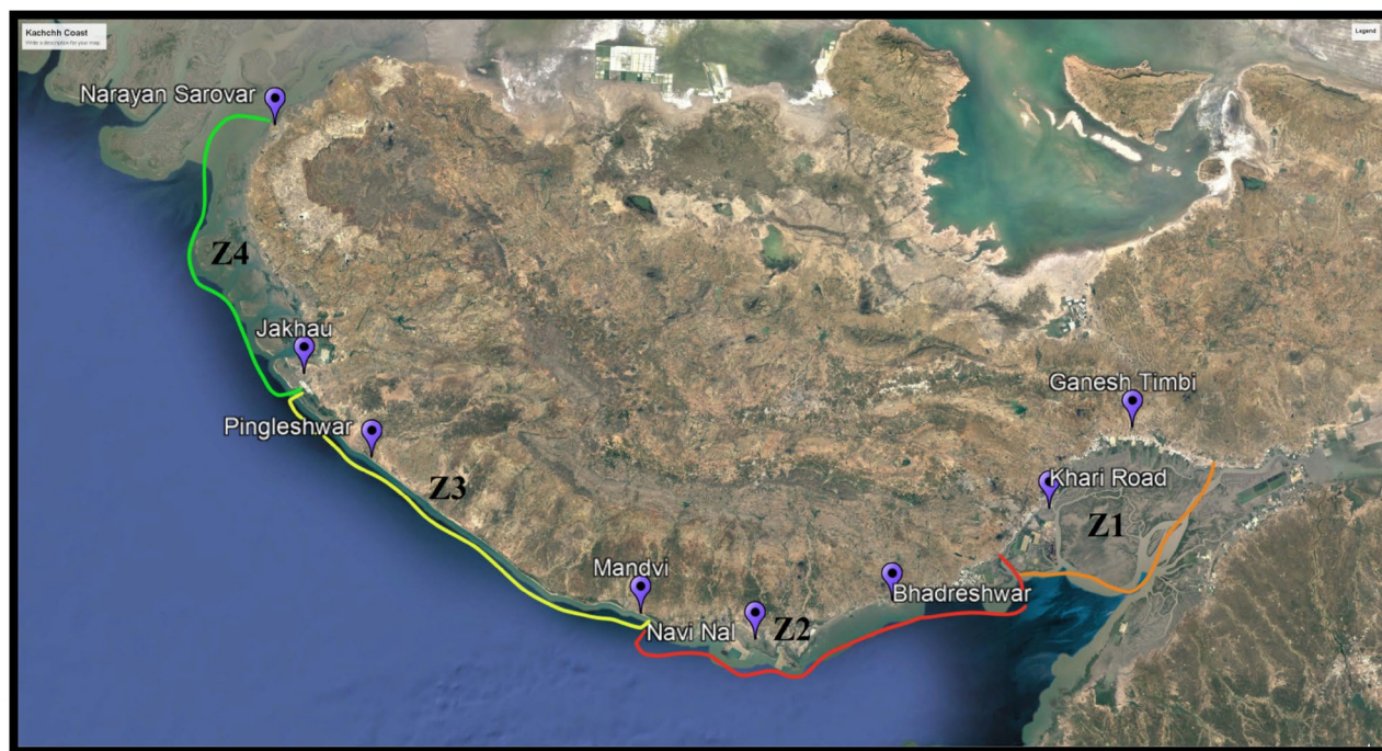
Figure 1. Coastal belt of Kachchh, Gujarat, India. The image was from Google Earth Pro 7.3.3 ( https://www.google.com/intl/en_uk/earth/versions/#earth-pro ).

Experimental research and field studies on plants including a collection of plant materials according to the Indian Biodiversity Act (2002) and methods used for sample collection as per the American Public Health Association,