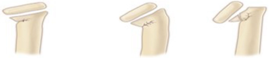
Figure 1. Classification of radial neck fractures in children (O'Brien type).

According to the different treatment methods, the patients were divided into 4 groups, namely Group A (plaster fixation without manual reduction or surgery), Group B (manual reduction and plaster external fixation), Group C (percutaneous prying reduction and internal fixation), and Group D (open reduction and internal fixation) (Figs. 2, 3, 4 and 5 and Table 1).