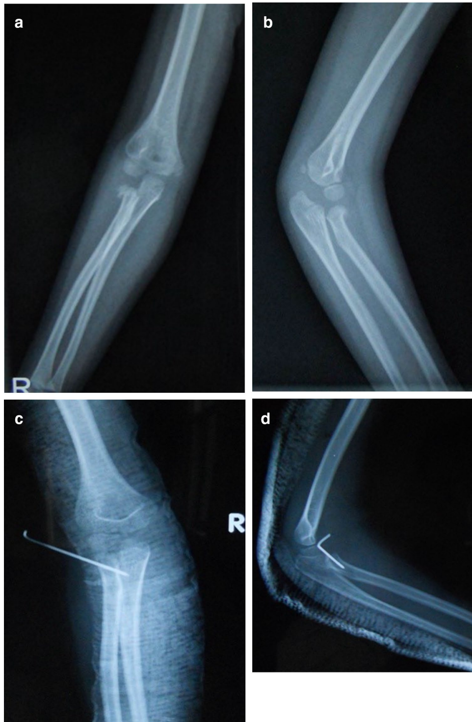
Figure 3. 6-year-old girl, right radial neck fracture, type II, PKWL Kirschner wire (A) and (B) preoperative, (C) and (D) postoperative.