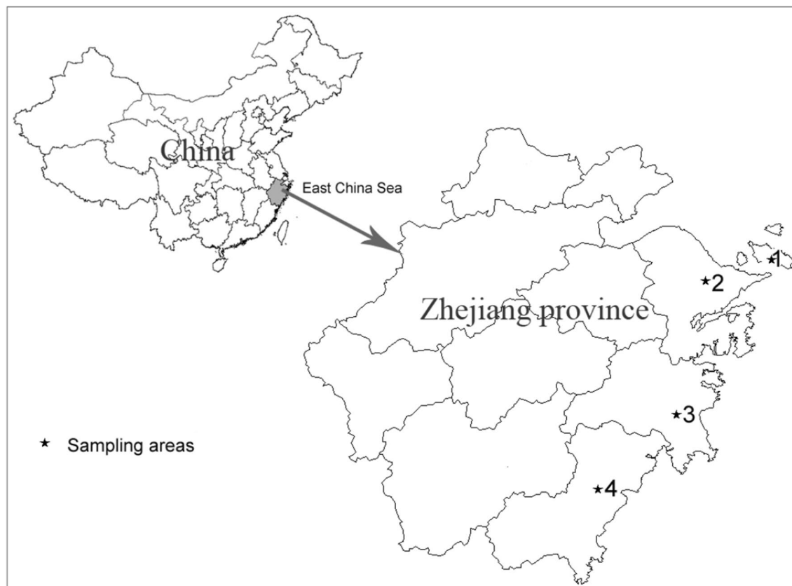
Figure 1. Simple map of the sampling areas of Zhejiang province, China.