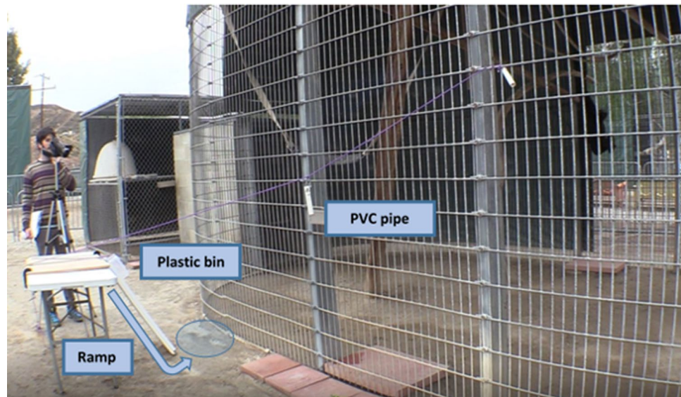
Figure 3. Details of the study setting. The arrow and the circle represent the movement of the food rewards rolling down and the area where the rewards land.

try to obtain any of the released rewards). Relatedly, gibbons engaged in cofeeding events relatively often. One possibility is that such a high degree of social tolerance towards conspecifics results from gibbons' unique pair-living social system compared to other great apes, although future studies should inspect this relationship in more detail. Overall, the inclusion of gibbons in studies exploring the nature of primate socio-cognitive abilities is critical. It will help to elucidate the nature of our prosocial motivations and their relationship to specific socio-ecological pressures and ultimately to understand how they have evolved since the last common ancestor with all living apes.