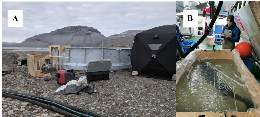
Figure 2. Photographs of the two respirometers used in this study. (A) Depicts the large “circular” type respirometer used in Tremblay Sound in 2018. (B) Depicts the smaller “rectangular” type respirometer used in Scott Inlet in 2019.

Despite having a seemingly unremarkable mass and temperature adjusted metabolic rate in comparison to other sharks, it is important to consider the implications of the extremely low whole-animal metabolic rates measured here at ecologically relevant experimental temperatures, as it relates to the ecological role of Greenland sharks in the Arctic. With such low energetic needs, Greenland sharks may be capable of surviving extended periods of time without feeding following the consumption of energy rich prey 26 . For example, assuming an assimilation efficiency of 73% 47 , and that 1 mol O 2 is equal to 434 kJ 48 , the aRMR of the 126 kg shark studied in the Tremblay Sound respirometer would translate to a daily caloric requirement of only 192 kcal. If we further assume Greenland sharks can store energy in their tissues or as undigested food in their gut 49 , the consumption of a whole juvenile seal weighing 25 kg could theoretically allow the shark to survive > 365 days without subsequent feeding events (caloric value of ringed seal taken from 50 ). This preliminary estimate accepts that aRMR measured at a specific activity level and temperature is not necessarily representative of the individual’s field metabolic rate but serves to contextualize its low metabolic rate in ecological terms.