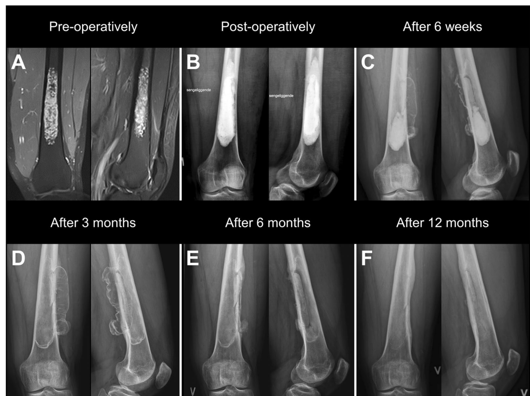
Figure 3. A patient treated by curettage and defect filling, using a combination of CERAMENT|G (20mL) and CERAMENT|BONE VOID FILLER (36mL) via an extended cortical window, for a large enchondroma in the left distal femur. (A) Pre-operative MRI-scan. (B) Post-operative x-ray without product-leakage (C,D) X-rays after 6 weeks and 12 weeks showing soft-tissue leakage. (E) X-ray after 6 months showing almost complete resorption of soft-tissue leakage. Outline of the bone window is clearly visible. (F) X-ray after 12 months showing complete resorption of the soft-tissue leakage, blurring of the bone window, and thickening of the posterior and lateral cortex.

developed a calcification in the trochanteric bursa after treatment of a bone defect in the proximal femur. No leak of bone-graft substitute was seen in this patient.