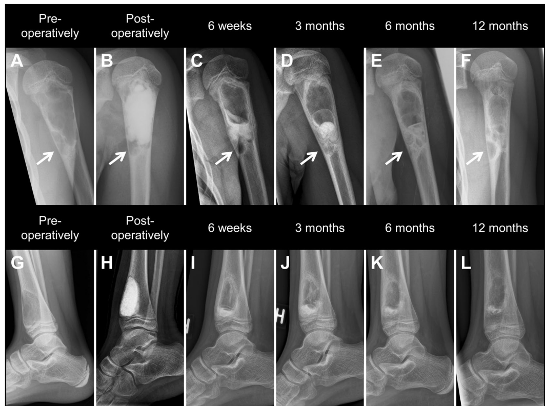
Figure 1. Upper row: Simple cyst of the proximal humerus treated by curettage and defect-filling using CERAMENT|BONE VOID FILLER. (A,B) Pre- and post-operative x-rays showing decreased cortical thickness as well as an isolated chamber in the distal part of the affected bone (arrow), which is not accessed or filled during the operation. (C–E) X-rays taken after 6 weeks, 3 and 6 months showing increasing product resorption and cortical thickening. (F) X-ray taken after 12 months showing normal cortical thickness in the main part of the cyst, and reduced cortical thickness in the non-treated distal chamber as a sign of possible local recurrence. Lower row: Aneurysmal bone cyst of the distal tibia treated by curettage and defect-filling using CERAMENT|BONE VOID FILLER. (G,H) Pre- and post-operative x-rays showing decreased anterior cortical thickness and complete defect filling. (I–L) X-rays taken after 6 weeks and 3, 6, and 12 months showing increasing product resorption and cortical thickening. Note the increasing distance between the growth-plate and the distal aspect of the cyst.

percutaneously by injection of a sclerosing agent (sclerotherapy). Two patients received re-curettage due to suspected recurrence of a lesion with a non-specific primary diagnose, but neither recurrence nor a more precise diagnose was confirmed. Three patients received a second grafting procedure in order to further increase bone stock, although no progression or recurrence was seen: two children with large bone cysts in the pelvis and proximal femur received re-injection of CERAMENT|BONE VOID FILLER: one filled percutaneously (pelvis) after 13 months, and one filled at the same time as a scheduled plate removal after 20 months; and one adult was treated with curettage and bone grafting after 10 months, due to a large remaining cavity just beneath the knee-joint (Fig. 2, lower row). One patient with an intra-osseous ganglion received re-curettage and bone-grafting after 14 months, due to persistent pain from the ankle joint, which was expected to resolve by complete cavity-filling, despite a normal cortical thickness.