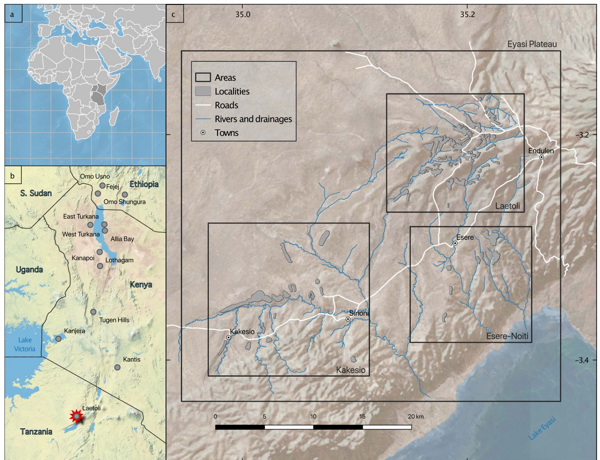
Fig. 1 Map showing the location of Laetoli relative to other paleoanthropology fossil sites.