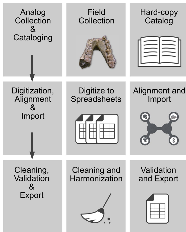
Fig. 3 Data collection and processing workflow.