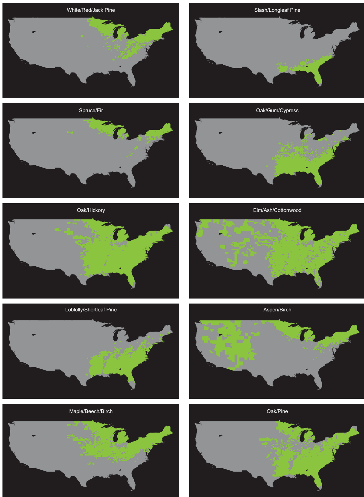
Fig. 2 | Geographic range of forest groups based on observations taken by USFS. Note: This figure for each forest group details (in green) all counties in which the US Forest Service Forest Inventory and Analysis (USFS-FIA) database has

recorded the forest group's presence between 1968 and 2018. This is based on its annual resource inventories and is limited to observations of stands between 1 and 100 years of age.