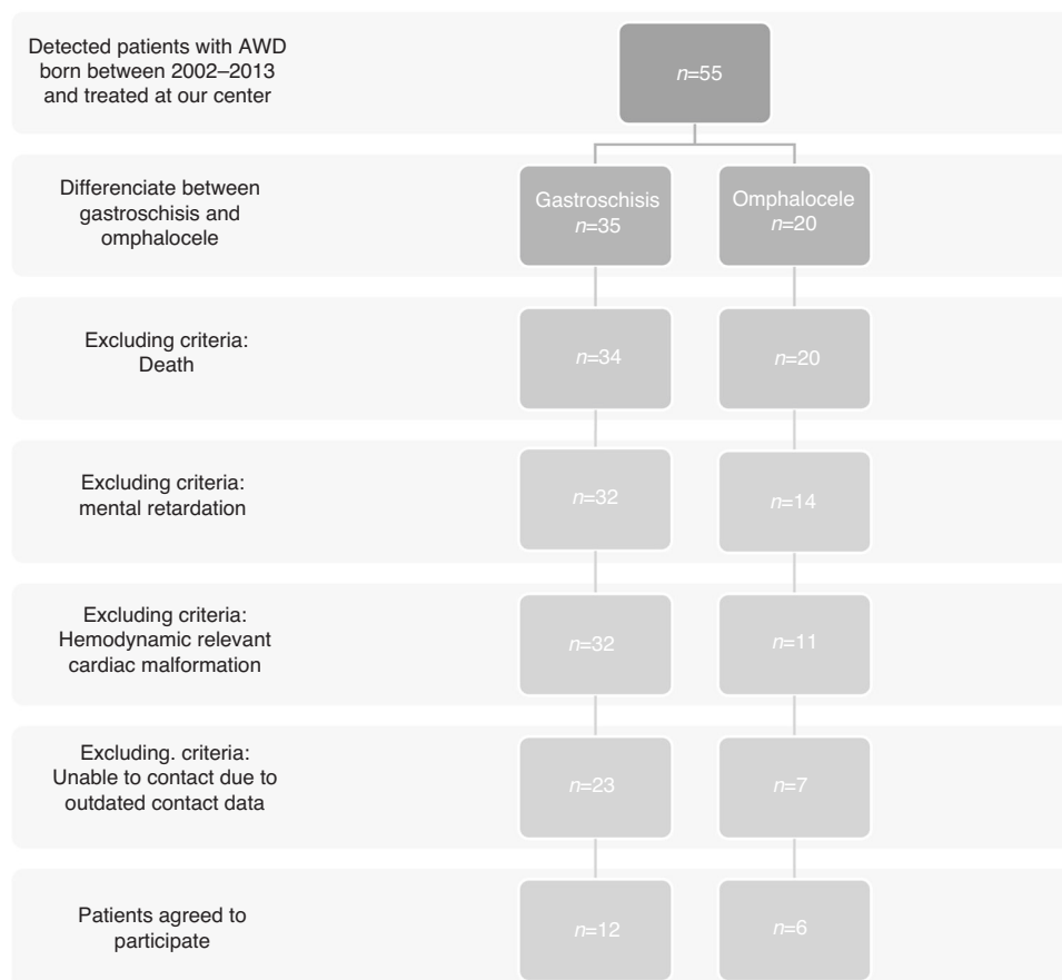
Fig. 2 CONSORT diagram of the included and excluded patients.

One patient (8%) with GS had a congenital colonic atresia as an associated malformation and was classified as complicated GS in