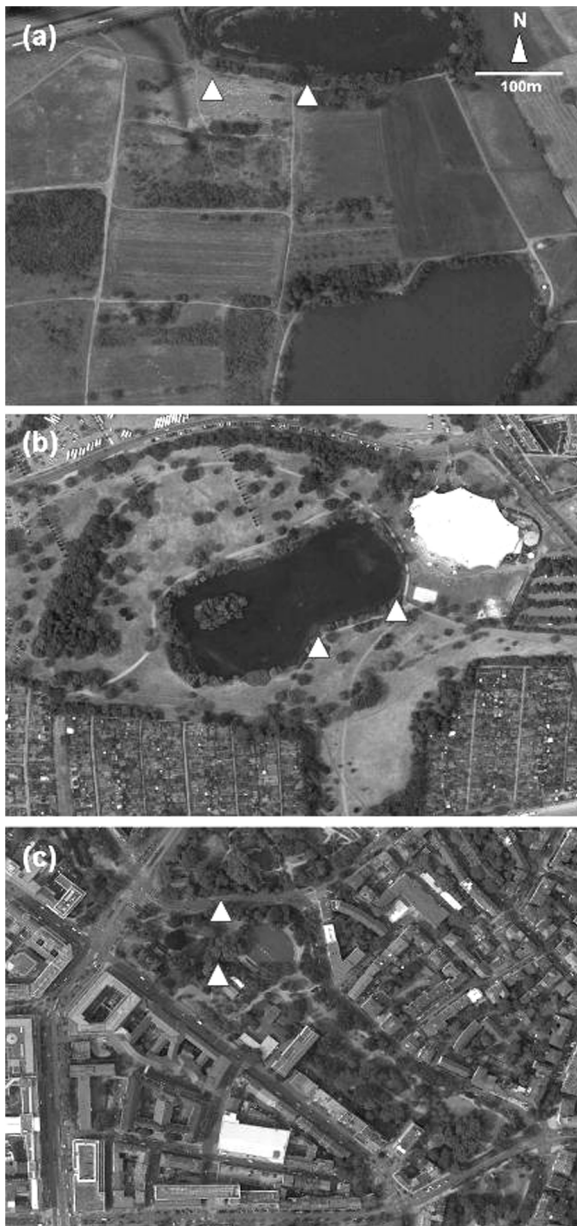
Fig. 1. Study sites.

(a) One of our rural study sites at Maintal, (b) suburban site Rebstockpark, and (c) urban study site no 1. White triangles indicate focal burrows within study sites.