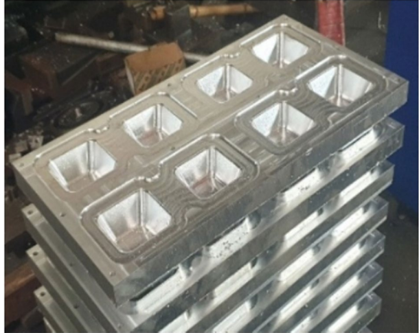
Fig. 4 Trimming machine