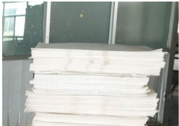
Fig. 5 Bagasse pulp sheets