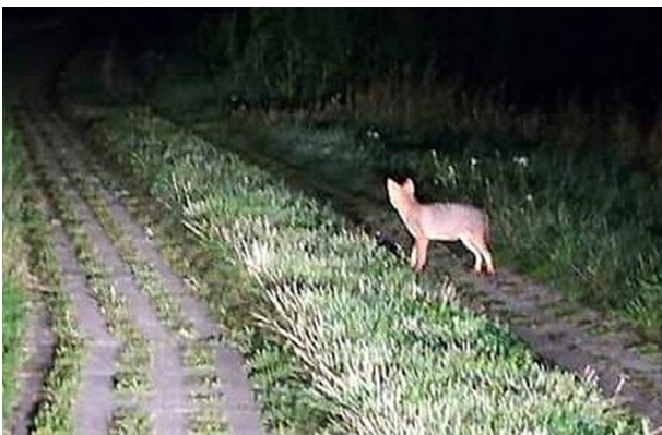
Fig. 2 Young golden jackal observed on 5th August 2017 in Kwidzyn area (N Poland)

Since the first case of golden jackal presence in Poland in 2015, very limited number of observations or dead individuals had been recorded (Kowalczyk et al. 2015, this study). This indicates movement phase and exploration by migratory individuals rather than establishment of the population. However, first records of reproduction from the same year as the first observation of the species in Poland indicate earlier than reported expansion and local population establishment far to the north from its original distribution range. The delay in species expansion discovery is probably related to the lack of knowledge on the animal and failure to recognize individuals of this new species. Since the first observation of golden jackal, media in Poland reported almost every new record of the species. This led to the increasing number of species records reported by public; however, only very few cases turned out to be golden jackals. Majority of them were foxes, often suffering from scabies, dogs or wolves (R. Kowalczyk, personal comm). However, increasing knowledge on the species brings increasing number of confirmed observations. The scenario is similar to the expansion of raccoon dogs in Poland during the 1950s, when very fast spread and establishment of population was recorded, exceeding the biological capacity of the species (Nowak and Pielowski 1964; Kowalczyk et al. 2009; Kauhala