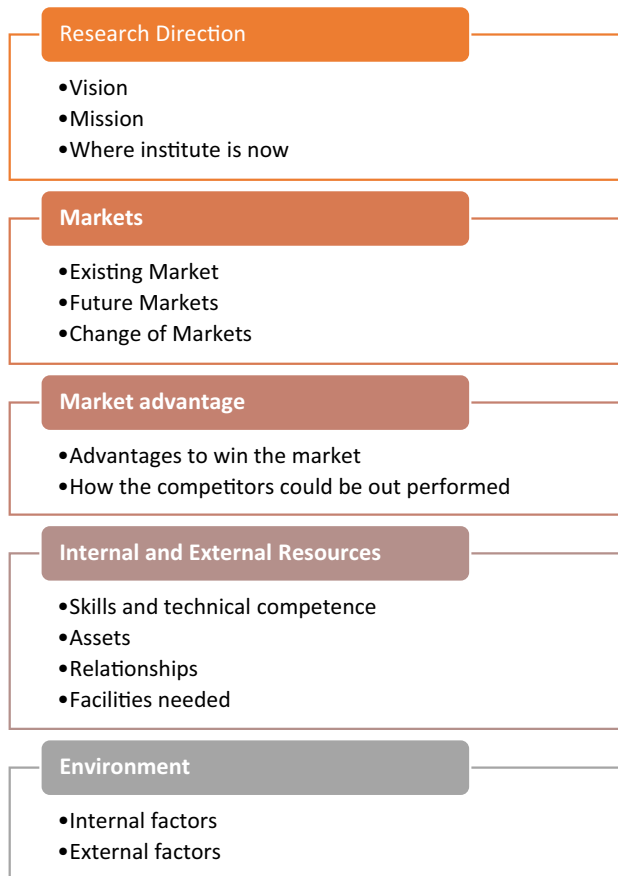
Fig. 2 The specific areas in the business of a research institutes work for commercial agriculture

There are two important elements responsible for the performance of the research business: