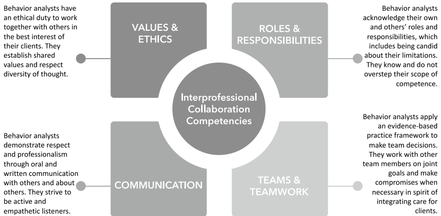
Fig. 1 Interprofessional collaboration competencies, adapted from Interprofessional Education Collaborative (2016)

independence from them, strengthens both the science and practice of behavior analysis. Therefore, we argue that the future of behavior analysis depends on the humble behaviorists' ability to move beyond disciplinary power struggles and actively seek to bring about positive change in our world through strategic inter-professional collaboration.