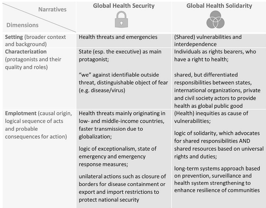
Fig. 2 From Global Health Security to Global Health Solidarity.

2017). This is not only due to the increasing mobility of goods and people, but also to our way of production and consumption that leads to environmental changes like climate change, land degradation or biodiversity loss. Although experts have been aware of these threats, which have been at the center especially of the human security agenda for some time, governments and societies still seem to be unprepared for the challenges that lie ahead. We would argue that this is also a result of the dominant narrative of health security and its lack of basing its dominant logic of action on a normative framework that opens up a long-term systemic perspective without losing sight of individuals as bearers of duties and rights. Therefore, we suggest an alternative narrative of global health that does not rest on a logic of exceptionalism but on the logic of solidarity (see Fig. 2).