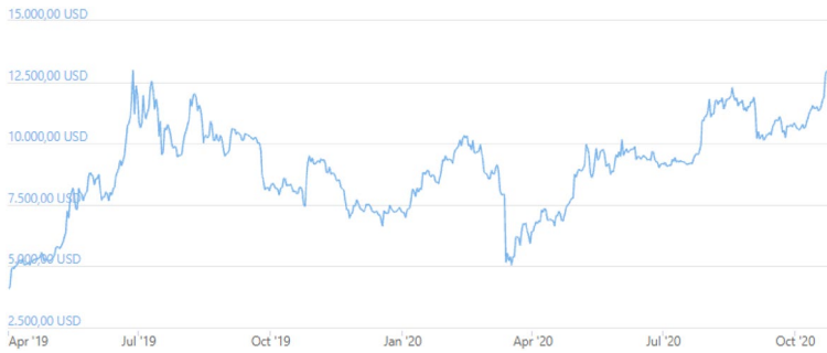
Fig. 1 Bitcoin value in USD on the period April 1, 2019–October 31, 2020

Independently of the rationale for the relation between Tether and Bitcoin, these papers suggest that Tether deserves a privileged position in cryptocurrency markets for trading reasons. We corroborate this interpretation showing that Tether introduced a structural change, separating the markets against Tether from the markets against US dollar. Our analysis suggests that it is the first group of markets that drives price formation, making the second group play a secondary role.