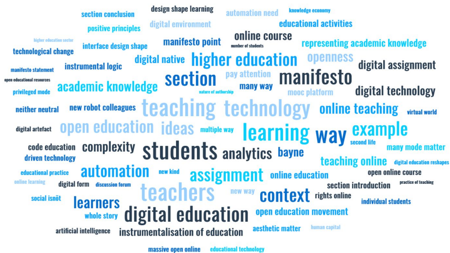
Fig. 3 Most frequent phrases in The Manifesto produced with MonkeyLearn ( https://monkeylearn.com/word-cloud/ ). Accessed 15 July 2021.)

My first concern is about what we teach when we teach online. Discussions about digital education often focus on ‘how’, ‘why’, and ‘whom’ we teach but rarely say much about ‘what’ we teach. And, when they discuss ‘what’, the most common answer is ‘academic knowledge’. The most frequent phrases in The Manifesto illustrate this (Fig. 3). One may argue that this is the way it should be. (In the end, universities are custodians of academic knowledge.) However, the pressing challenges of the present day—be it climate change, workplace diversity or truth decay—urge us to prepare students for working with knowledge across and beyond academic disciplines.