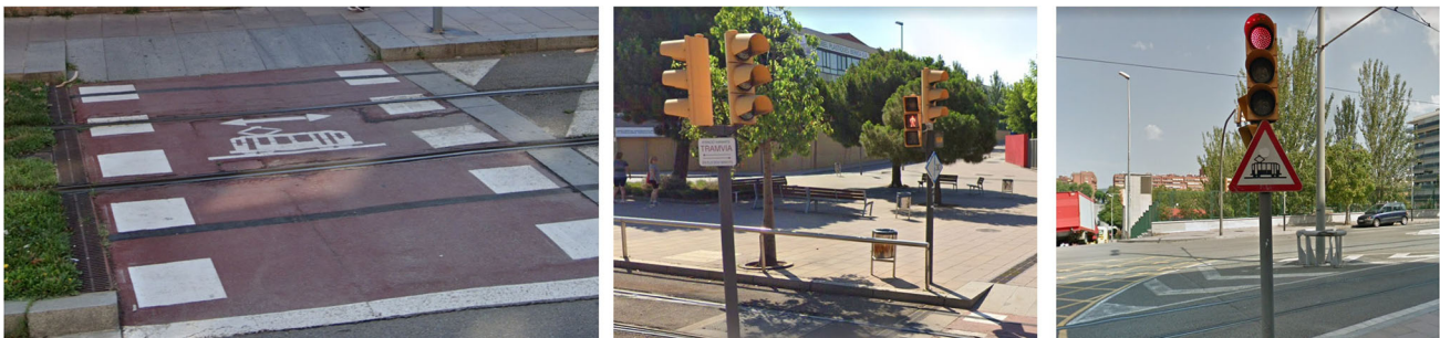
Fig. 4 Horizontal and vertical sign systems—Barcelona Spain

In the original publication Figures 4, 5, 6 have been removed due to not having the appropriate permissions to reproduce the images contained in the figures. Figure 8 has a problem of R2 mark. The revised figures are provided in this correction.