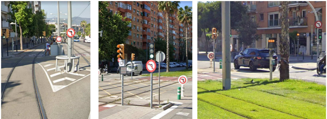
Fig. 6 Vertical no-turn signs. Trams in Barcelona and Valencia