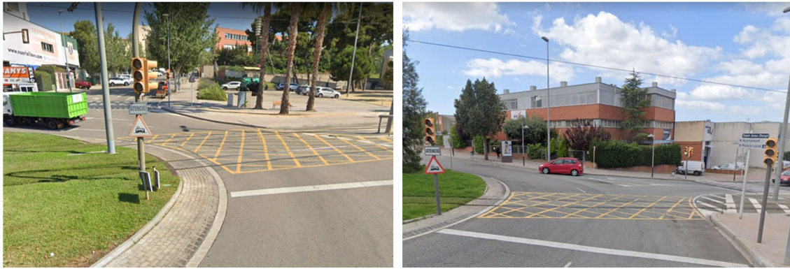
Fig. 5 Road carriageway near an intersection with a tramway line (Spain)