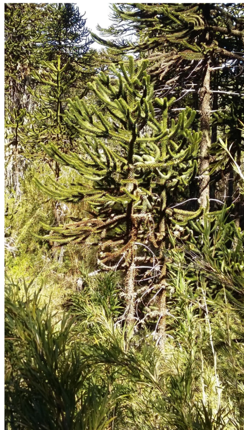
Fig. 1 Araucaria araucana juvenile trees at Reserva Nacional Conguillio, Southern Chile, 2 years after a 5-year long drought (2010–2015). Notice the dead branches in the lower crowns (corresponding to old branch cohorts) and the vigorous regrowth in the upper crown (corresponding to branches formed after drought).

monkey puzzle, Araucariaceae) in Southern Chile, where tree mortality has occurred after a severe drought during the 2010–2015 period [63, 64]. Right after the drought period (early summer 2016), NSC concentration (averaged for roots and needles) was significantly lower in unhealthy trees compared to healthy ones (5 and 8%, respectively, p = 0.004 , no difference among tissues); however, after the following year, when precipitation was back to historical “normal” values, unhealthy trees increased their concentrations up to levels closer (but still different) to healthy trees (7 and 9%, for unhealthy and healthy, respectively; p = 0.015 for health status) (M. Jiménez-Castillo, unpublished data). The NSC recovery of unhealthy trees was accompanied by a healthier appearance of trees (defined by the levels of regrowth and greenness), which after the rainy year looked more similar to healthy ones (Fig. 1). The cases of F. sylvatica and A. araucana suggest that the use of NSC stores promotes tree recovery after moderate drought, in support of our hypothesis. Nevertheless, it remains uncertain whether NSC concentrations can be recovered after more severe droughts than those considered by these cases.