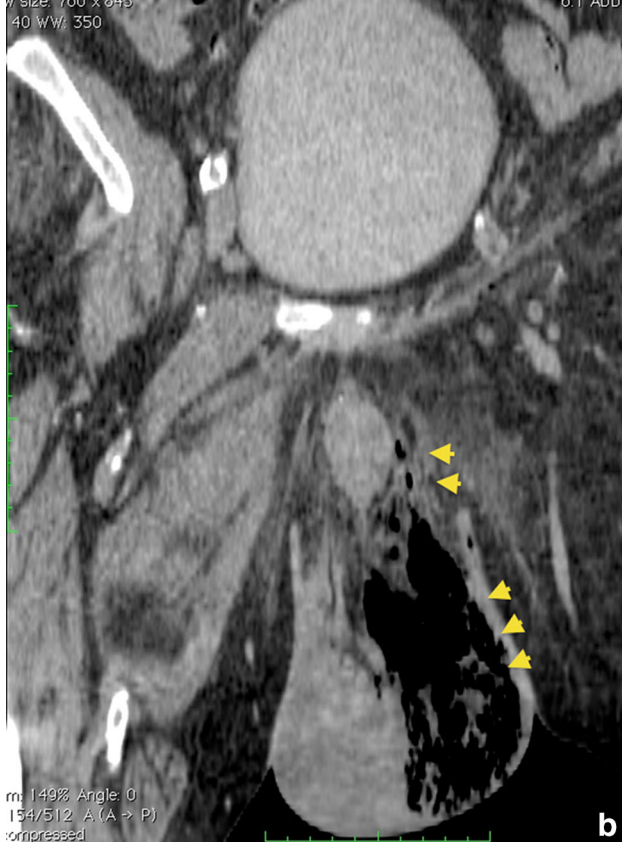
Fig. 2 Contrast-enhanced CT a axial image magnified (WL: -205 WW: 916) and b coronal image through the scrotum confirm scrotal wall thickening and subcutaneous gas ( yellow arrowhead ), consistent with Fournier gangrene; Left testis ( red arrow )

surgical operation was performed in emergency to avoid a rapid spread of tissue necrosis (Fig. 3) and a possible development towards septic shock. The recovery was completed with "restitutio ad integrum" and no relapses were recorded at follow-up.