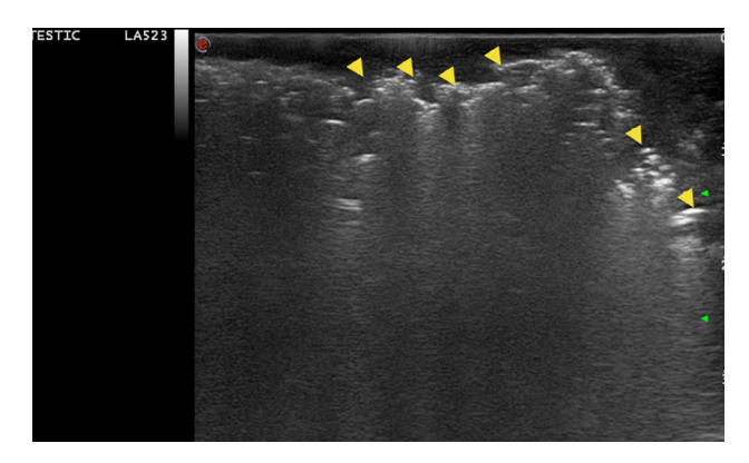
Fig. 1 Sonographic image shows left scrotal wall thickening. Multiple echogenic foci with dirty shadowing are present, representing gas in soft tissues ( yellow arrowhead )

crepitus and sometimes frank septic shock [9]. Because of its potential complications, it is important to diagnose the disease process as early as possible. Although the diagnosis of Fournier's gangrene is often made clinically, emergency ultrasonography (US) and computed tomography (CT) lead to an early diagnosis with accurate assessment of disease extent. Early diagnosis in Fournier gangrene is crucial because immediate surgical debridement and antibiotics can reduce the high mortality [7].