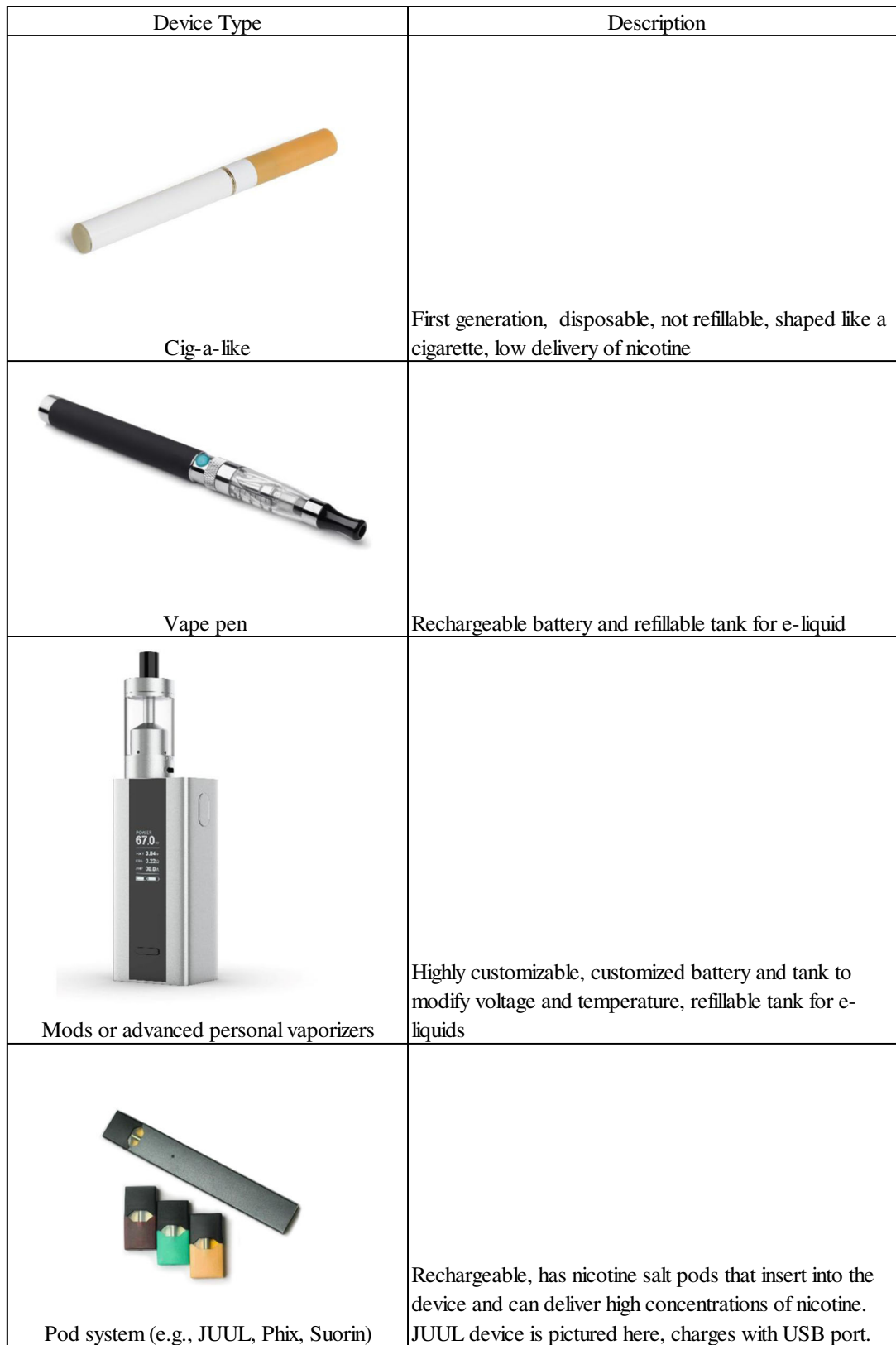
Table 1 Examples of e-cigarette device type.