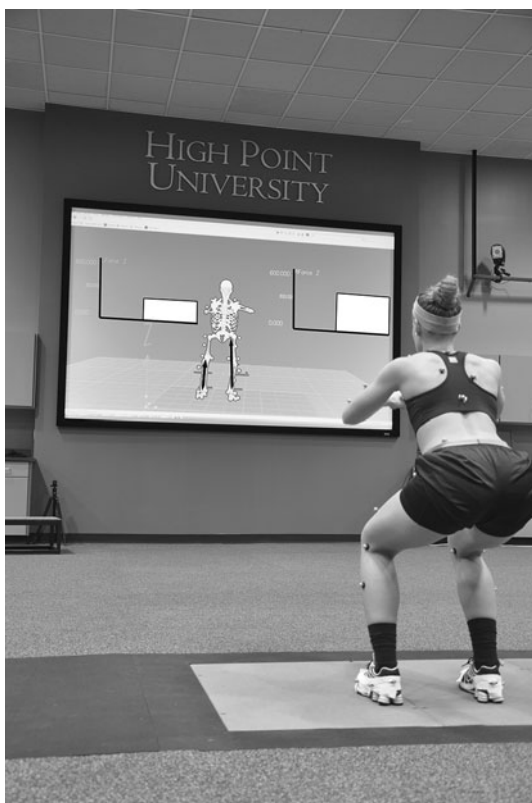
Fig. 2 Real-time feedback during a squat. The patient receives information on the magnitude and direction of ground reaction forces. Visual and auditory cues are provided to correct imbalances

through activation of these internal action-related representations [59].