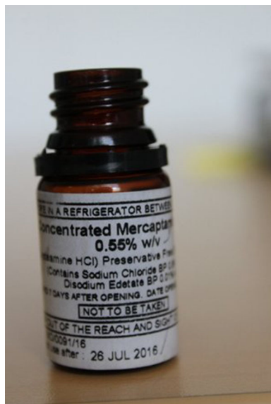
Fig. 1 Cysteamine eye drops prepared by the Guy's and St. Thomas' Hospital pharmacy for cystinosis patients at Manchester Royal Eye Hospital

INC patients attending the paediatric ophthalmology clinic routinely underwent a structured clinical assessment consisting of age-appropriate measure of visual acuity, contrast sensitivity, colour vision and, where indicated, ocular motility assessment. For older children, visual fields were formally assessed with Humphrey 24-2 automated perimetry (Carl Zeiss