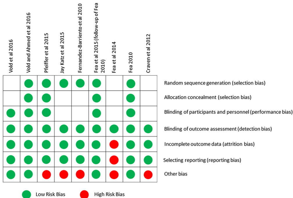
Fig. 2 Reviewers’ judgement for each risk-of-bias item per RCT