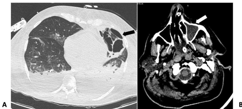
Fig. 2 a Thoracic computed tomography (CT) scan showed buried cavitary lesions in the left lung; b cranial CT scan showed corpuscular material in the left maxillary sinus

Recently in a retrospective study, Koehler et al. analysed a cohort of patients admitted to ICU due to COVID-19 showing moderate to severe acute respiratory distress syndrome (ARDS) who developed invasive pulmonary aspergillosis as a consequence of the immune-paralysis related to SARS-CoV-2 infection [18]. Similarly, in the present case neither corticosteroids nor immunosuppressant therapies were administered, but the patient showed a severe form of COVID-19 with multiple organ dysfunctions and a significant and sustained lymphopenia with N/L ratio alteration; the latter has been recently described to be highly associated with the most severe clinical presentation and the worst