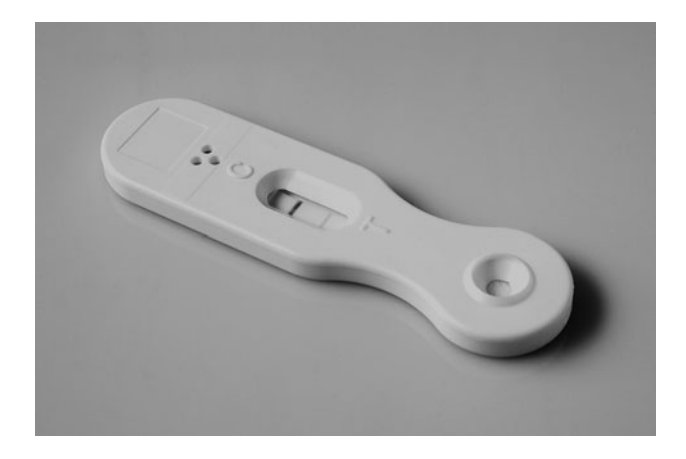
Fig. 2 Example of a weak positive Aspergillus -LFD test. The upper band (C) is the control band, indicating a valid test, while the lower band (T) is the sample band, indicating test positivity

The Aspergillus-LFD was performed from archived sera as follows (see also Fig. 1): 50 \mu L of serum were mixed with 100 \mu L of PBS/EDTA (4 % w/v). The solution was incubated for 3 min at 100 °C and then centrifuged for 5 min at 16,000g. 100 \mu L of the clear supernatant was applied to the LFD and the results were read after 15 min by three laboratory assistants in a blinded fashion. Serum from a healthy individual served as a control, against which test line results were interpreted as negative, weak positive, moderate positive or strong positive (Fig. 2). The devices used were from the same batch of prototypes, prior to the development of a commercially available test format.