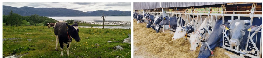
Fig. 1 Examples of different European farming systems for dairy cattle production.