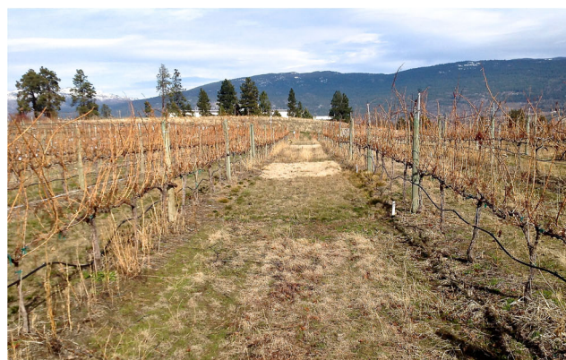
Fig. 1 Examples of common cover cropping strategies and experimentation at the Summerland Research and Development Center, British Columbia. Top : a permanent cover of mixed grass species in a cherry orchard and bottom : a long-term cover crop experiment in wine grapes evaluating mixtures and monocultures of native and introduced grasses

Here, we incorporate ecological knowledge of plant-soil feedbacks into the context of perennial agriculture to explore the use of cover crops to increase microbial diversity and manage crop decline. The specific aims of this review are to (1) synthesize our current understanding of how plant communities influence soil microbial communities into the context of cover crops; (2) highlight key beneficial soil microbes and their role in affecting crop decline; and (3) present plant-based strategies to mitigate decline of perennial crops through soil microbial diversity.