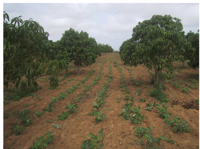
Fig. 3 Traditional intercropping cowpea in mango orchards in the Niaye area (Senegal) during rainy season (H. de Bon)