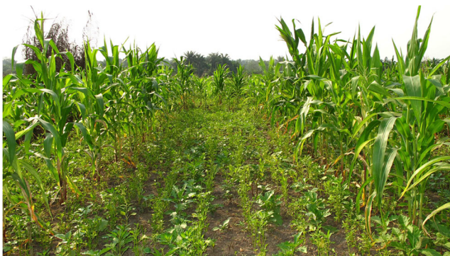
Fig. 2 Intercropping in a lowland field in South of Benin: maize, West African sorrel ( Corchorus olitorius ), and African eggplant ( Solanum macrocarpon ) (J. Huat)

Fruit crops are perennial crops and are cultivated on a long-term basis, unlike vegetables which are short-cycle, of between 2 and 8 months, as well as cash crops. Is there a