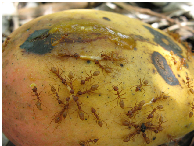
Fig. 4 Ants ( Oecophylla longinoda ) capturing fruit flies larvae in a mango, picture taken in a mango orchard in Central Benin

To control fruit flies, the solution proposed by scientists is an IPM package based on orchard sanitation, GF-120 bait sprays (Vayssières et al. 2009b) and biological control with weaver ants (Van Mele et al. 2007; Adandonon et al. 2009) and parasitoids. In these examples, the solutions proposed by scientists were based on biological control and monitoring. This IPM package is used by farmers in Benin, and the innovation adoption of weaver ants as biological control agents used in mango pilot orchards in the framework of West African fruit fly initiative (WAFFI) is especially successful.