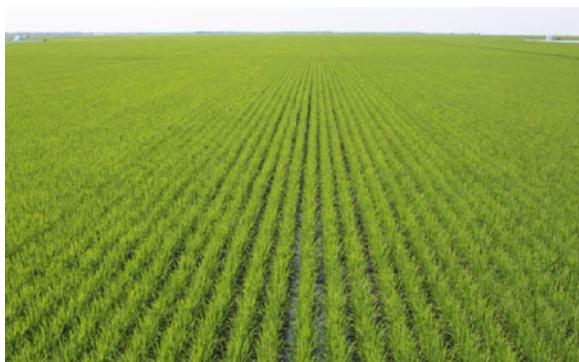
Fig. 1 Large-scale rice farming in Jiansanjiang, Heilongjiang Province, Northeast China. Each farmer's household manages an average of about 25 ha land. Jiansanjiang has 740,000 ha arable land, and 86 % is rice. The commercial grain rate is about 95 %, making this region increasingly important for China's food security

annual air temperature is about 1–2 °C and the mean yearly precipitation ranges from 500 to 600 mm (Wang and Yang 2001). Average temperatures reach –18 °C in January and 21–22 °C in July. The frost-free period is only about 120–140 days long (Zhang et al. 2009). The maximum values of temperature and precipitation are both observed in July and August. The rainfall from June to September covers about 72 % of the annual amount, with 59 % of the yearly precipitation occurring from June to August (Yan et al. 2002).