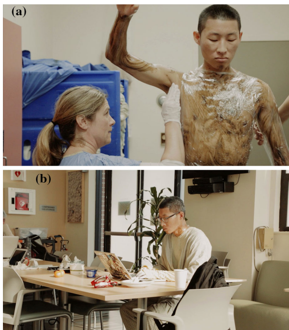
Fig. 2 Treatment procedure. a Nurse occluding tar with plastic wrap. b Patient spends 4–5 h in waiting area during tar therapy