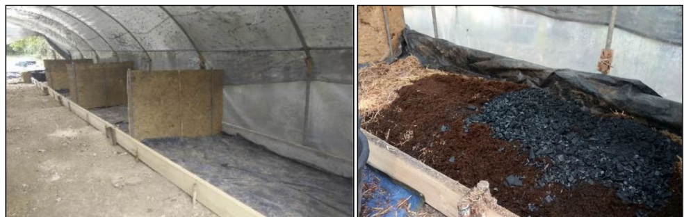
Fig. 1 Farm-scale co-composting site—windrows and piles

The measured C/N index of the CD pile was equal to 36.3, close to the optimal value for composting reported in literature [32, 33]; in general, higher C/N values of the initial matrix can lead to extend the duration of the composting process [34]. Compared to the control C/N ratio (i.e., the C/N value for the CD pile), the other piles (CB1, CB2, and CB3) showed higher ratios, increasing with the addition of the biochar, which however gives the main contribution in terms of stable and recalcitrant C. The measured initial moisture content fall within the range indicated by literature, i.e., between 50 and 60% in mass fraction [33, 35, 36]. While the pH of the digestate, the main substrate matrix, was equal to 7.00, the pH of biochar was 7.97; this led to reaching an optimum environment for the