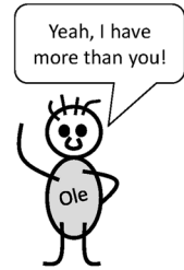
Fig. 3 Example of a mathematical problem in the learning environment and lesson series (cf. Hußmann and Schindler 2014a, p. 75)