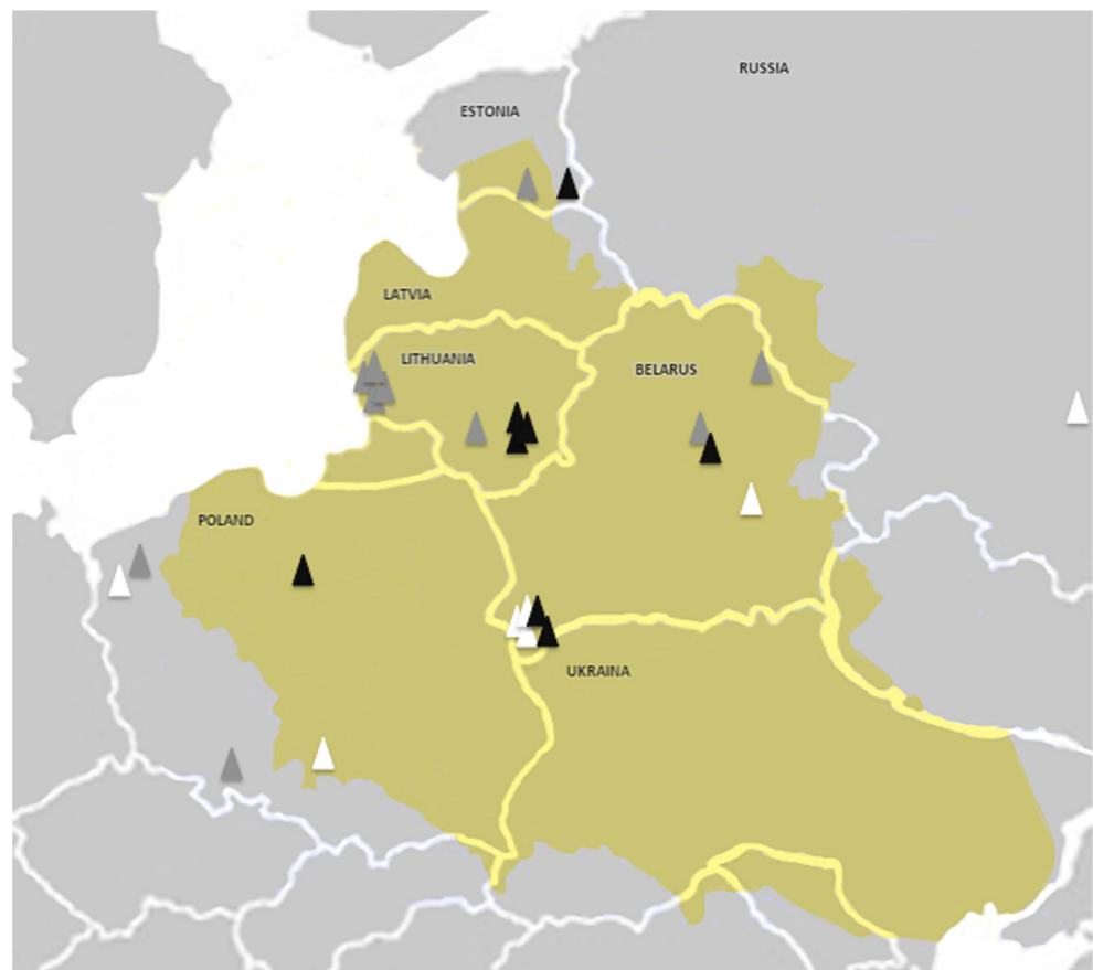
Fig. 2 The borders of Poland and neighboring countries: the Polish–Lithuanian Commonwealth (years 1569–1686) and after World War II with geographical distribution of MPS VI patients in the present series. The black triangles refer to patients homozygous for p.R152W mutation; the gray triangles refer to families with patients heterozygous for p.R152W mutation; the white triangles refer to families with patients with other mutations

In summary, individually, mucopolysaccharidoses are rare genetic diseases. However, as a group, they represent an important health problem in Poland. The prevalence data should be of interest to clinical geneticists, health care authorities, patients and their families, patient societies, and laboratories involved in the diagnosis of mucopolysaccharidoses. In addition, it provides useful information for decision-makers when it comes to estimating the social and genetic burden of these diseases to society or to considering the implementation of newborn screening programs for mucopolysaccharidoses. Prevalence rates studies are a prerequisite to health economic